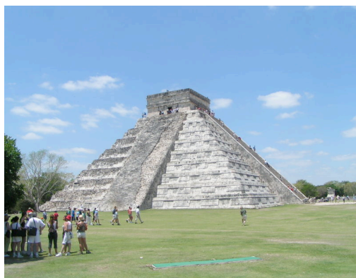
Figure 2. Pyramid of Kulkulan – Mexico (2)

There are also carvings of Quetzalcoatl, which are also important in the outer physical and acoustic structure. It has also been found like the Kings chamber that Kulkulan, contains a fundamental resonance frequency of F-sharp at 380hz, and F- sharp two octaves higher at 1550hz.(Hurtak, 2003).