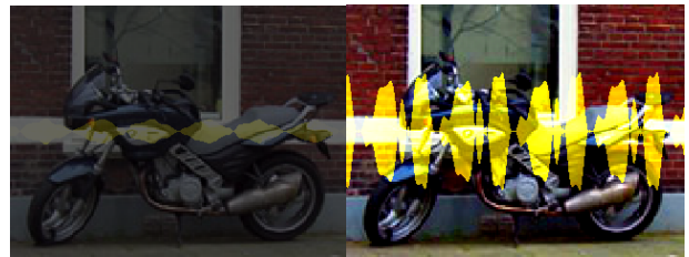
Figure 3. Two frames of video output from ArtsSync, demonstrating the coupling of audio amplitude with a brightness/contrast effect module.

The Effects section is where transformations are performed on the source image generated in the Image Generator section, using parameters received from the Controllers section. There are at present several effects modules implemented, ranging from simple brightness/contrast/saturation adjustments to radical image warping effects. Once again, there is no limit to the number of effects modules that can be implemented in the future, and individual modules can be activated or deactivated to conserve CPU power.