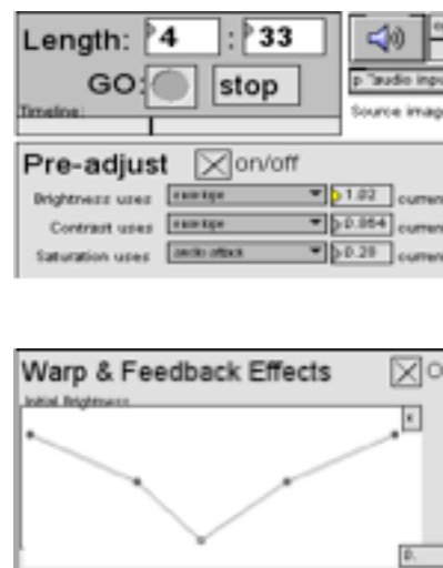
Figure 1. GUI with length of the piece (upper left) and breakpoint curves for values

The results are highly animated visual components with a very high degree of correlation to various levels of the audio components, and thus provide potential for enhanced concert experiences. The concerns are to avoid the pitfalls of static ‘screen-saver’ images of most ‘visualizers’ as well as images and music that seem poorly coordinated.